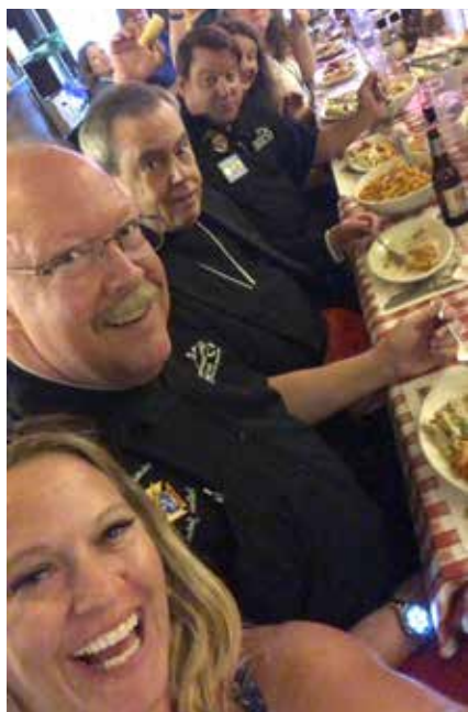
The Supreme Convention.