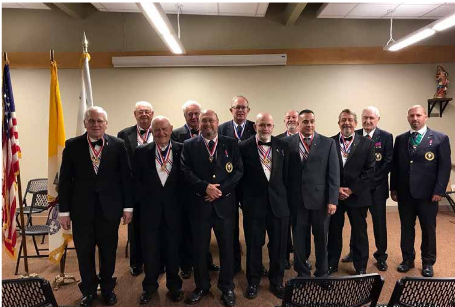
Assembly 2551 installation of officers (Mother Theresa Assembly).