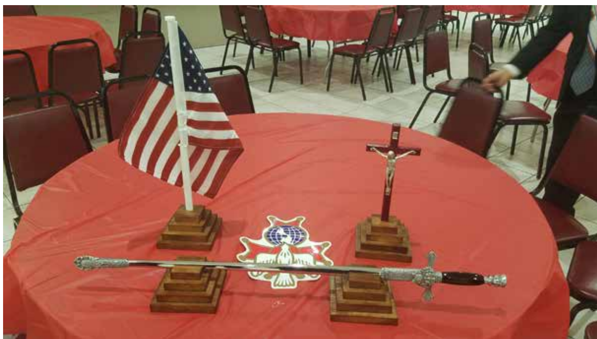
Paraphernalia for an assembly meeting made by the FN Viet Hua for his new assembly 3814, St Toma Thien.